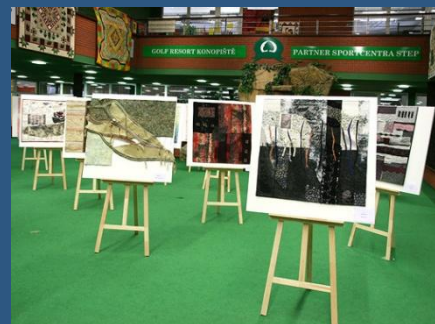
5 th Prague Patchwork Meeting

More Pictures from the 5 th PPM may be found on our webpage in the Gallery Section.