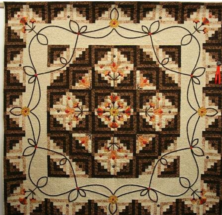
Milena Kankrlíková Window to an Autumn Garden